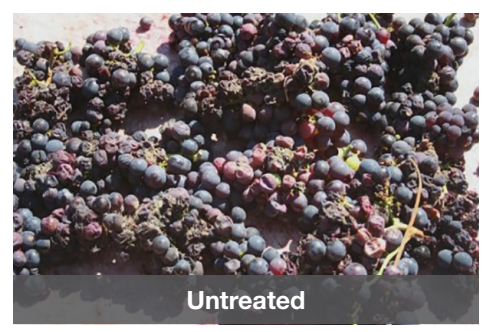
USWC0F102-2013. Grape: Zinfandel. Three applications. Hurstak. California